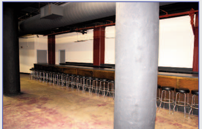
GROUND FLOOR BAR