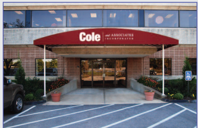
Suite 10 Lower Level Entrance