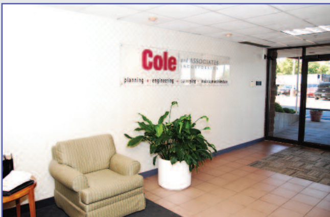
Suite 10 Lower Level