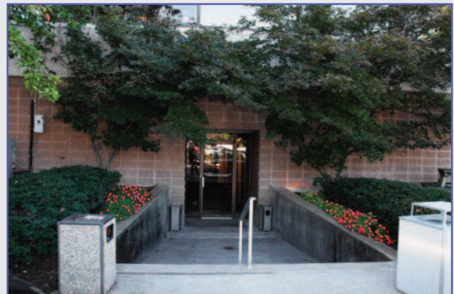
Lower Level Side Entrance