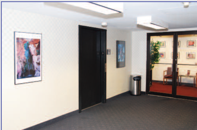
3rd Floor Lobby